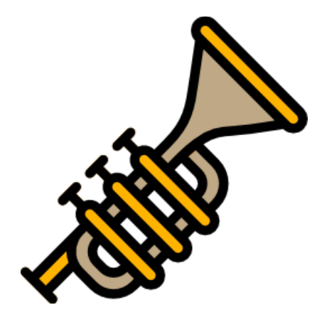
Practice a Hobby