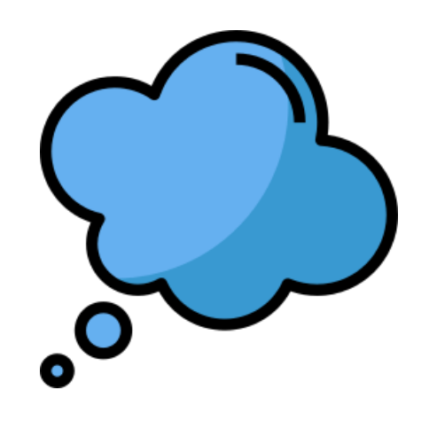
Think About What Is