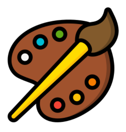
Draw Your Worry